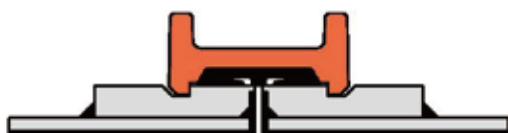
防碰撞橡胶内衬齐平