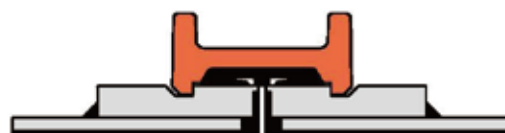
防碰撞橡胶内衬外凸